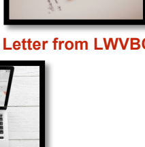
Letter from LWVBC