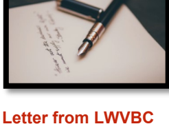
Letter from LWVBC