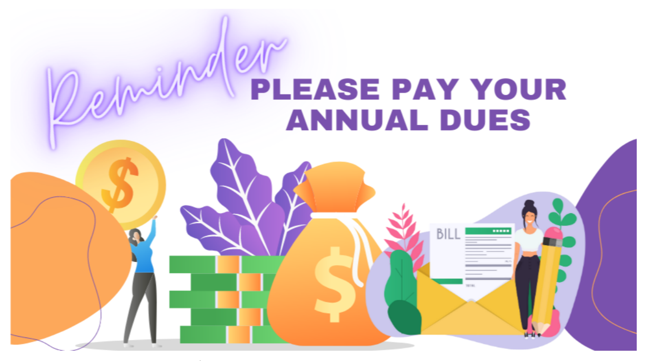
$60 for a regular renewing membership

CLICK HERE FOR THE MOST UPDATED CALENDAR ONLINE